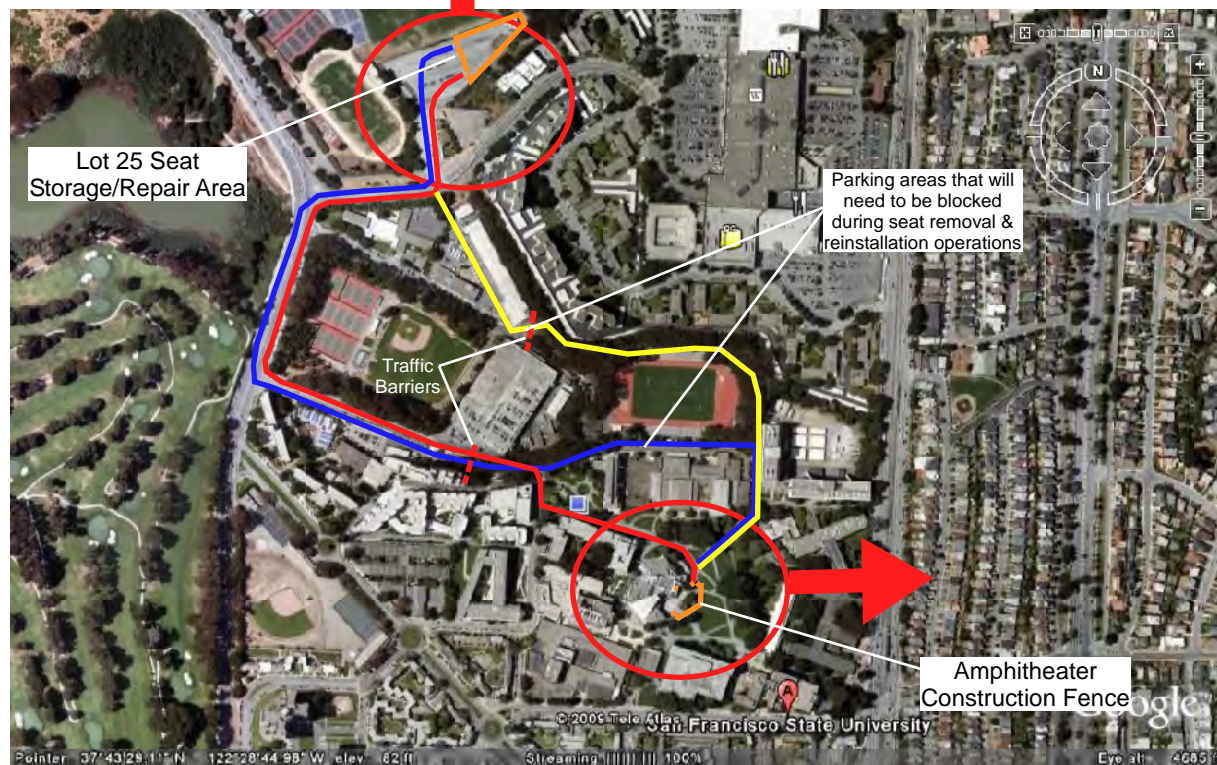
Transportation Route Plan